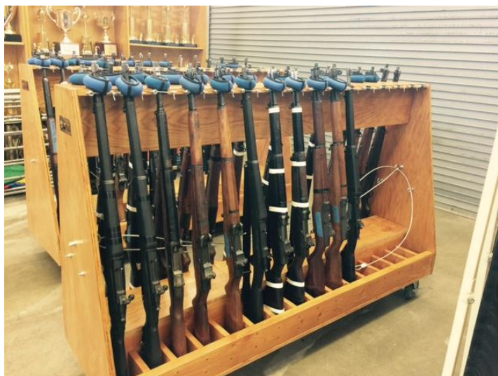
Here is the outcome of the Project.