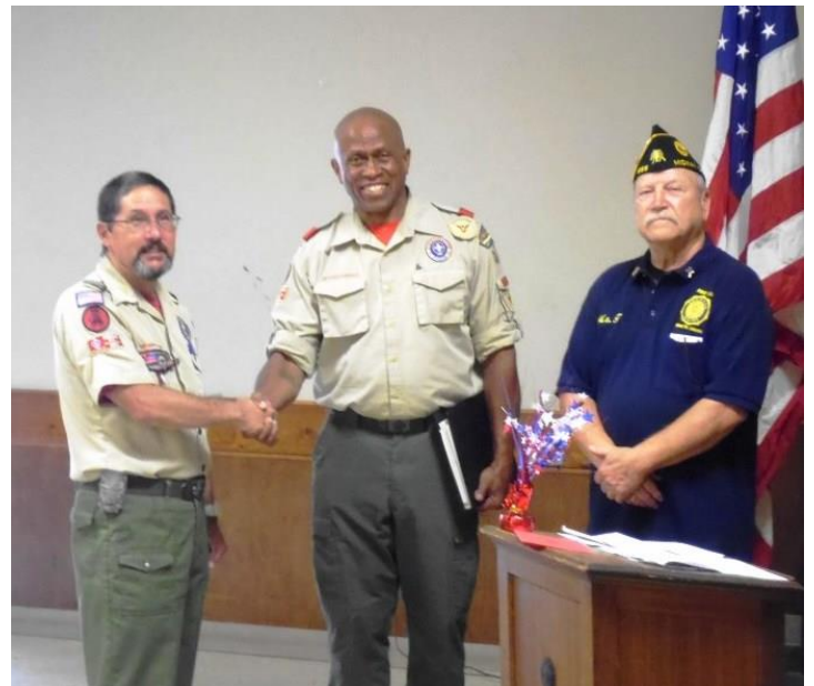
Newly Minted Scoutmaster, Time Flies.